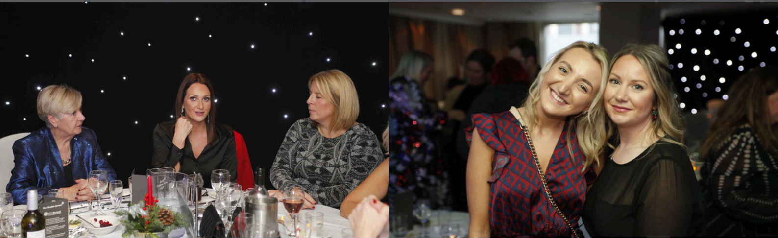
Table of ten - A table at the event for ten guests of your choice.

Table Sponsorship - Branding presence on sponsored table and recognition at event.